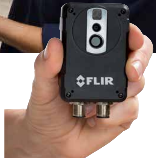
Combining thermal and visual cameras in a small, affordable package, the AX8 provides continuous temperature monitoring and alarming capabilities.

In their search of an efficient glue monitoring solution, Recochem decided to try a single-spot IR sensor. "Because the glue is heated, we can use temperature information to inspect the glue spots," says Adam Wolszczan. "However, we did not