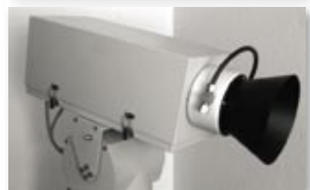
The ThermoVision™ A40 in its protective housing.