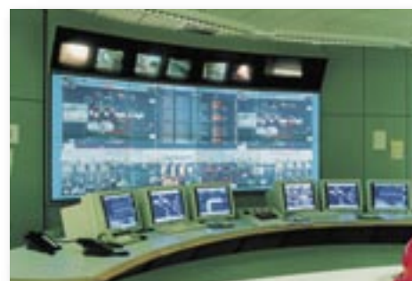
The control room of a waste bunker. If the ThermoVision™ A40 detects a hot spot an alarm will go off.

Although every infrared camera detector pixel measures a temperature value, the m.u.t engineers have chosen a temperature measurement, based on a 3x3 pixel grid. They considered 2x2 pixels as inadequate and uncertain. "3x3 pixel secures additional measurement accuracy and consequently a clearer image contrast, while excluding false alarms", says Volker Meliss, Marketing Director at m.u.t.