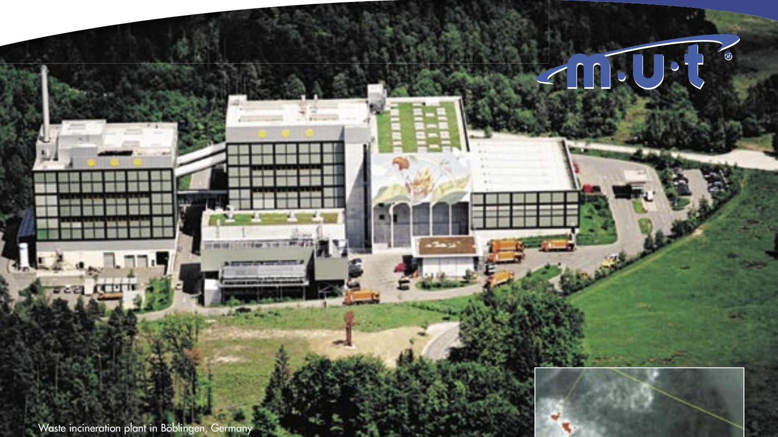
Waste incineration plant in Böblingen, Germany